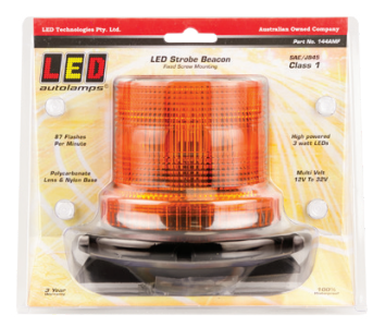
Part No. 144AMF - Blister

Fixed mount - Run cable through hole in mounting surface, fix beacon using bolts supplied